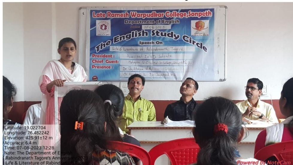
Our students delivering speech and actively participating in the DLCS activities