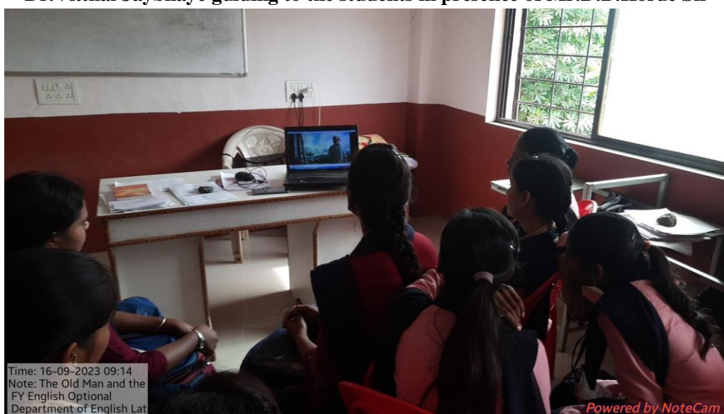
Students engaged in watching and doing GD on the video of novella The Old Man and the Sea as the part of DLCS