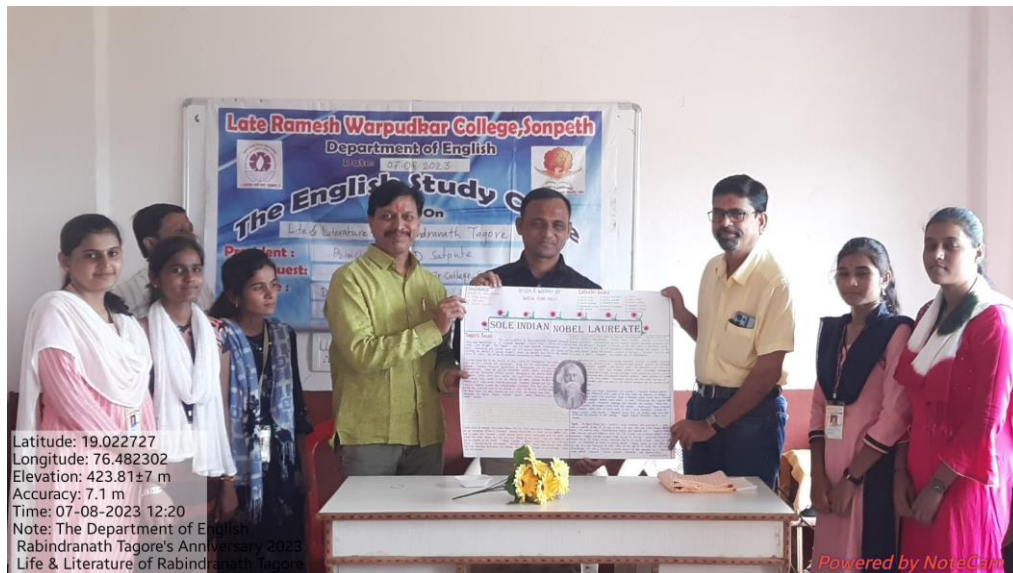
The Wall Poster entitled The Sole Nobel Laureate published under DLCS activity